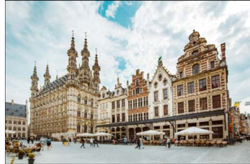
The Grand Beguinage , Leuven

April 23 General Meeting CPI Community Room 6990 W Hills Rd, Philomath, OR 97370