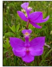
Native Orchids of Canada - page 6